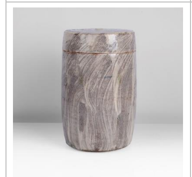
Lot 9 AR