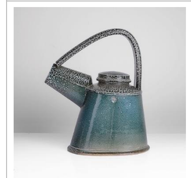
Lot 32 AR