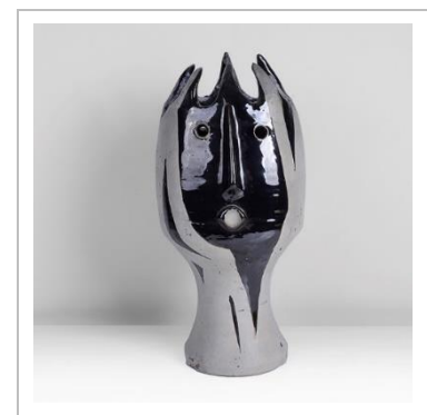
Lot 16 AR