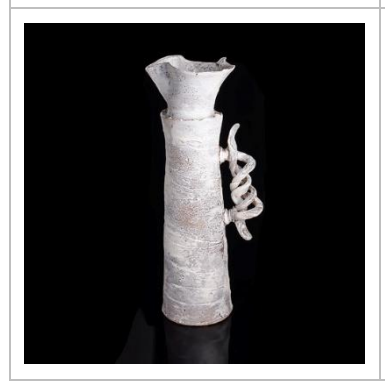
Lot 50 AR