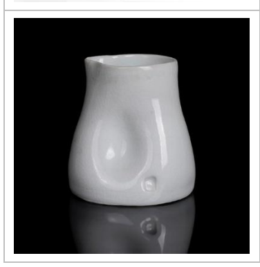
Lot 145 AR