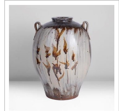
Lot 23 AR