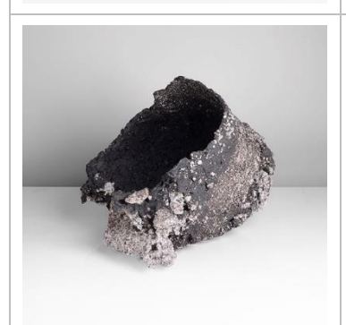
Lot 174 AR