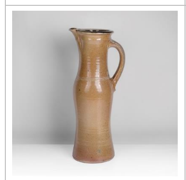
Lot 14 AR