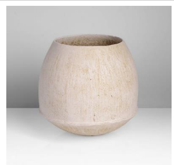
Lot 82 AR