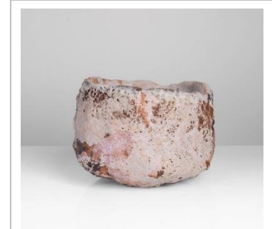
Lot 72 AR