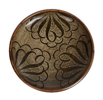
Lot 1 AR