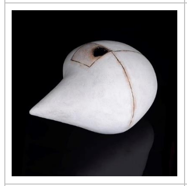
Lot 52 AR