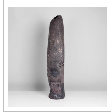
Lot 69 AR