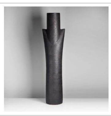
Lot 80 AR