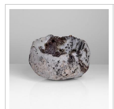
Lot 111 AR