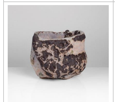
Lot 74 AR