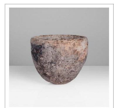
Lot 66 AR