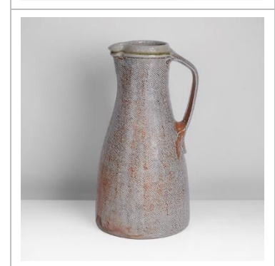
Lot 19 AR