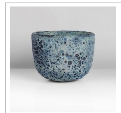
Lot 86 AR