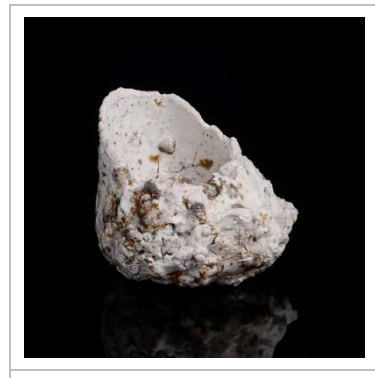
Lot 171 AR Aneta Regel (Polish, b.1976)