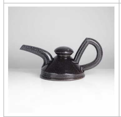
Lot 35 AR