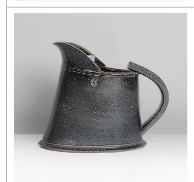
Lot 34 AR