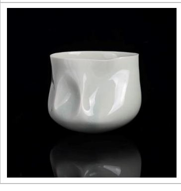
Lot 170 AR