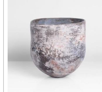
Lot 67 AR