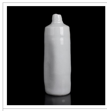
Lot 151 AR Edmund de Waal (British, b.1964)