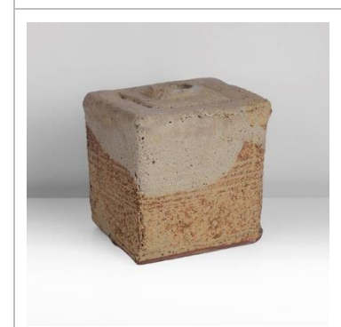
Lot 49 AR