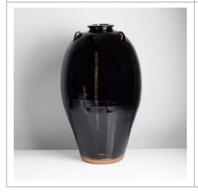
Lot 20 AR