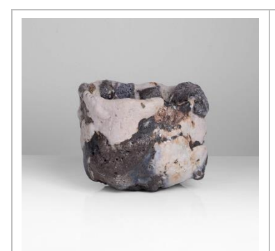
Lot 71 AR