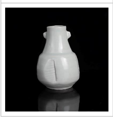
Lot 5 AR