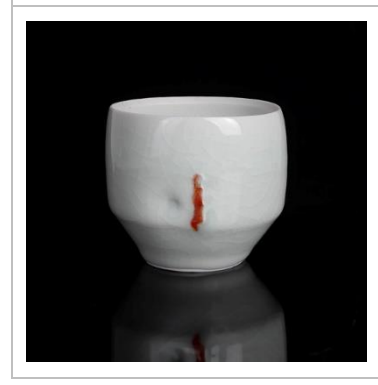
Lot 150 AR Edmund de Waal (British, b.1964)