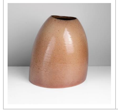
Lot 30 AR