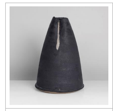
Lot 61 AR Dan Kelly (British, b.1953) Small Conical Vessel, circa 2000

Stoneware, dry black glaze over incised spirals texture, the conical form with white porcelain pour over deeply impressed vertical line at the narrow rim and shoulder, a torn edge to the base H 15.8cm, D 11.0cm