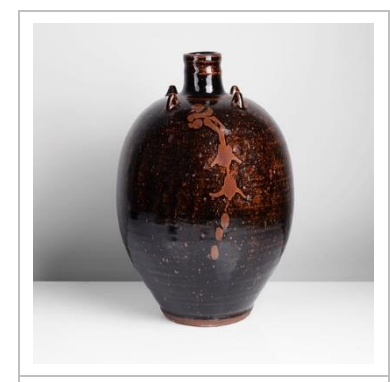
Lot 11 AR