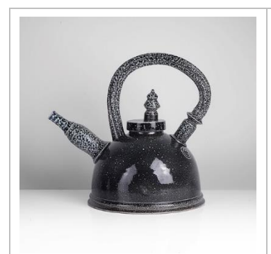
Lot 36 AR