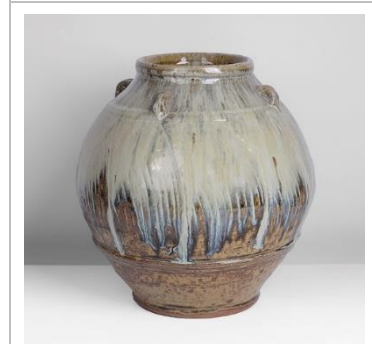
Lot 17 AR