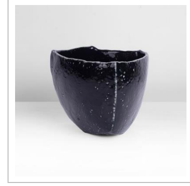
Lot 130 AR