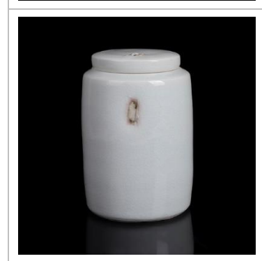
Lot 148 AR Edmund de Waal (British, b.1964)