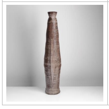
Lot 15 AR