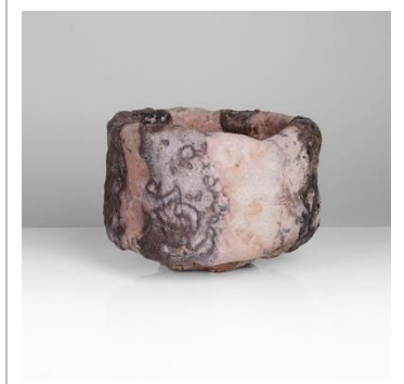
Lot 70 AR