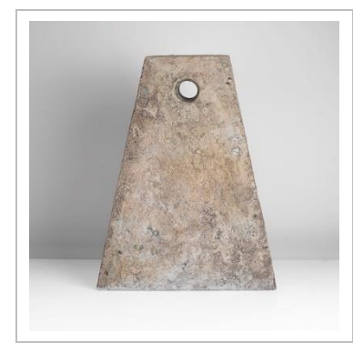
Lot 136 AR