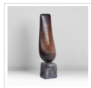
Lot 96 AR