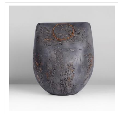
Lot 95 AR