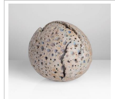
Lot 48 AR