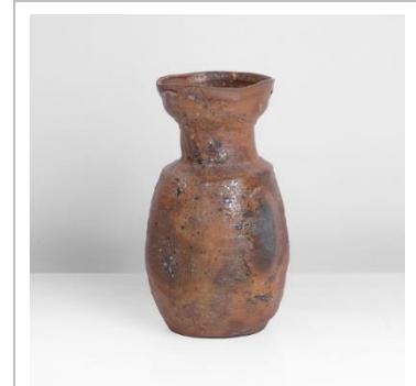
Lot 7 AR