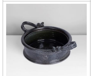
Lot 33 AR