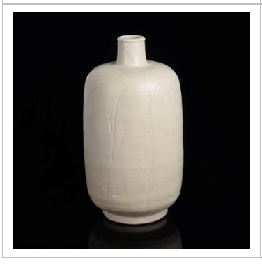
Lot 10 AR