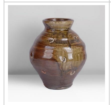
Lot 25 AR