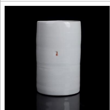
Lot 149 AR