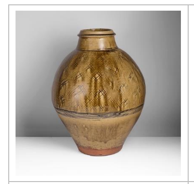
Lot 21 AR Phil Rogers (British, b.1951) Large Globular Vessel, circa 2000

Stoneware, green ash glaze with scraffito grid decoration, wide neck with collar, impressed maker's