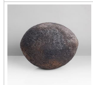
Lot 68 AR