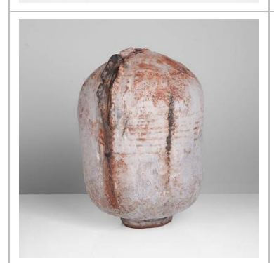
Lot 54 AR