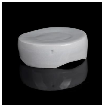
Lot 147 AR Edmund de Waal (British, b.1964)