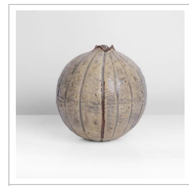
Lot 46 AR