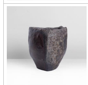
Lot 129 AR