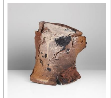
Lot 57 AR