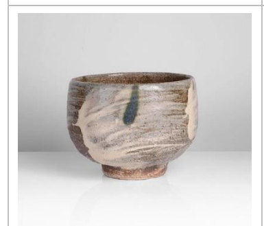
Lot 8 AR