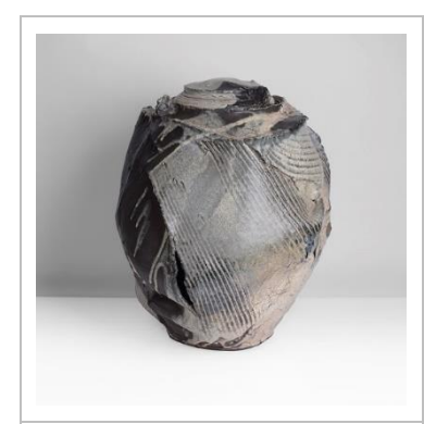
Lot 106 AR