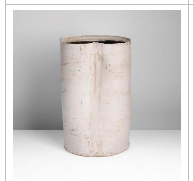
Lot 59 AR