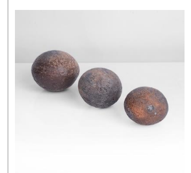
Lot 65 AR