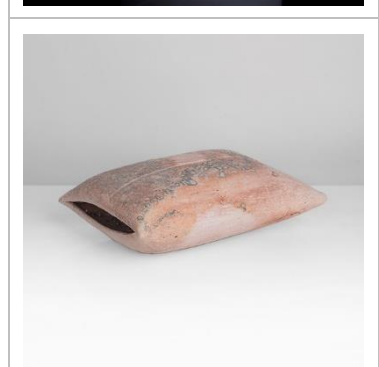
Lot 64 AR