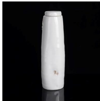
Lot 152 AR