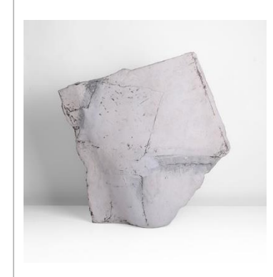
Lot 51 AR