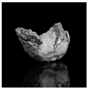
Lot 172 AR