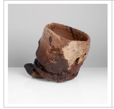
Lot 55 AR