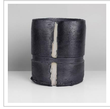
Lot 60 AR