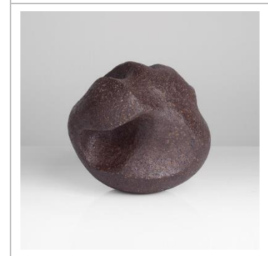
Lot 115 AR