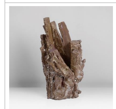
Lot 173 AR