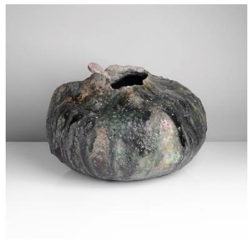
Lot 142 Aki Moriuchi (Japanese, b.1947)