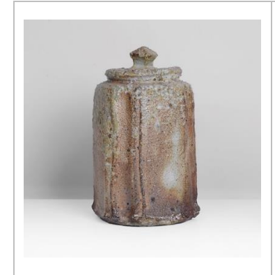
Lot 131 AR