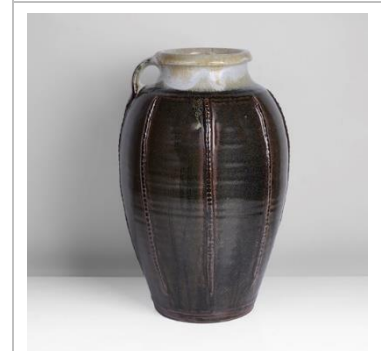
Lot 18 AR