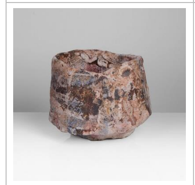
Lot 75 AR