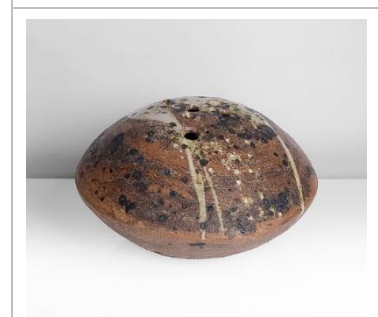
Lot 45 AR