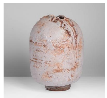
Lot 53 AR