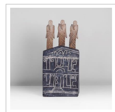
Lot 91 AR