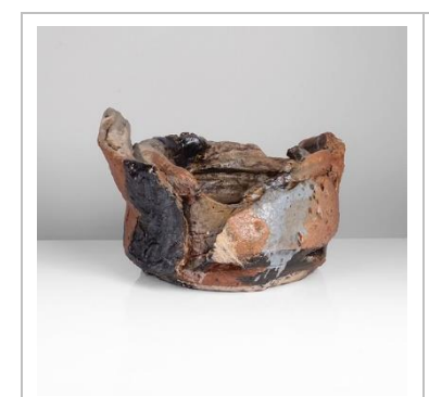
Lot 56 AR