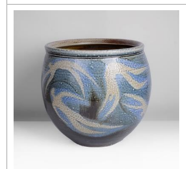
Lot 13 AR