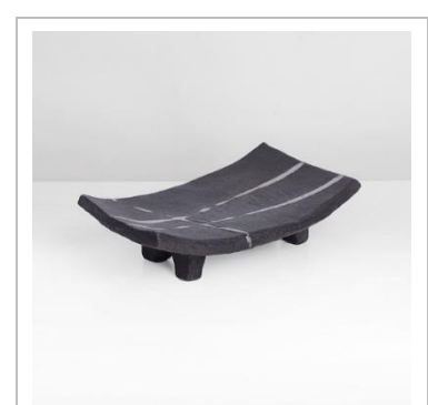
Lot 6 AR