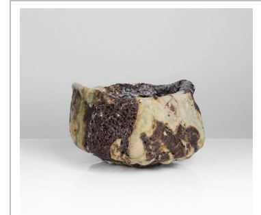
Lot 73 AR