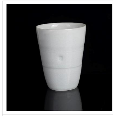
Lot 146 AR Edmund de Waal (British, b.1964)