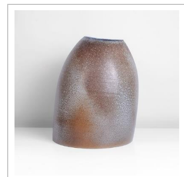
Lot 31 AR Jane Hamlyn (British, b.1940) 'Speckled Shadow Vase', circa 2003

Stoneware, leaning tapered cylinder with mottled green and brown saltglaze over a textured surface, blue saltglaze to the oval lip and interior, impressed JH seal