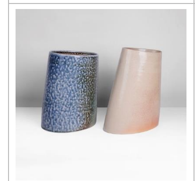
Lot 29 AR