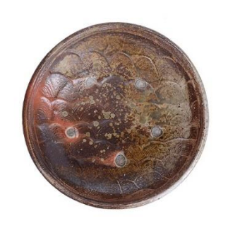
Lot 24 AR