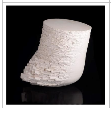
Lot 175 AR