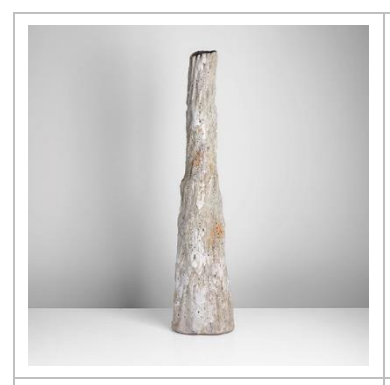
Lot 141 Aki Moriuchi (Japanese, b.1947)