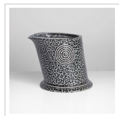
Lot 41 AR